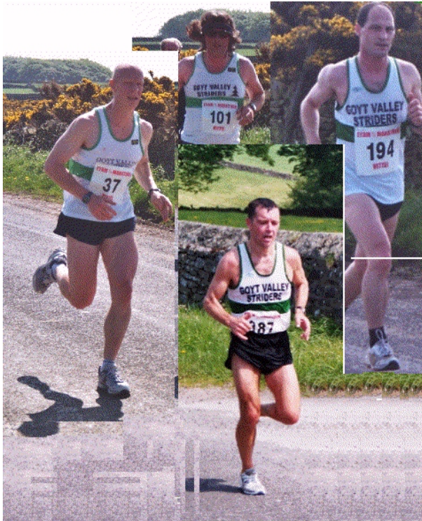
GVS quartet at Eyam